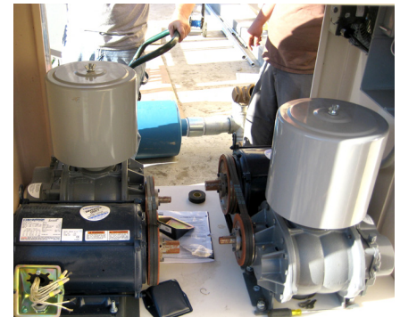
Air Blower Unit

Secondary and tertiary treatment systems include blowers, electrical controls, aeration equipment, settling, filters, and/or disinfection methods. Other ancillary equipment such as pumps, mixers, flow measuring equipment, filter media, and liquid level sensors may be utilized. Options for above-grade or at-grade systems include gratings and handrails; above-grade systems also include stairways or ladders. A Infiltrator Water Technologies representative can assist you in determining the system that will meet your requirements.