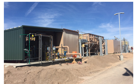
Complex treatment system servicing industry needs.