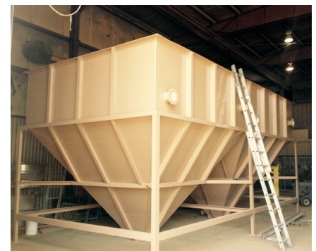
Secondary Clarifier with Chlorination