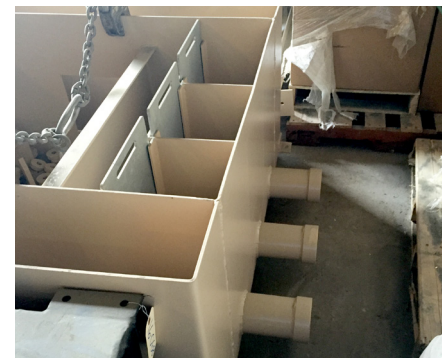
Flow Distribution Chamber