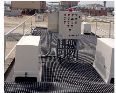
Electrical Control Console