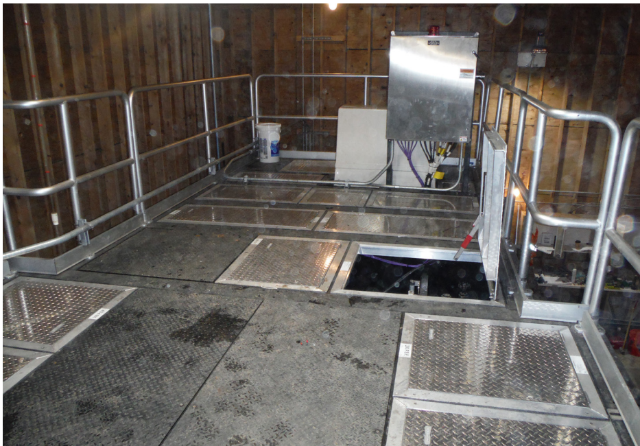
Completely enclosed and insulated

Infiltrator's package plants utilize the activated sludge process which allows naturally occurring bacteria to break down and oxidize organic contaminants in domestic wastewater. With the combination of aeration, clarification, and disinfection, the influent organic biological loading is consumed and converted into a highly-treated, clear, and odor-free effluent, allowing for subsurface disposal or direct discharge within stringent regulatory permit requirements. Additional tertiary treatment options can be integrated into the system as needed.