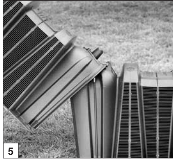
Connect the chambers.

5. Lift and place the end of the next chamber onto the previous chamber by holding it at a 90-degree angle. Line up the chamber end between the connector hook and locking pin at the top of the first chamber. Lower the chamber to the ground to connect the chambers.