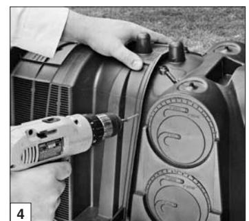
4 Insert drywall screws.

4. Insert two 1½" drywall screws on each side of the chambers. Tighten each screw until the end cap is firmly secured to the chamber.