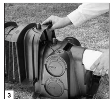
3 Place first chamber onto end cap.

3. Place the inlet end of the first chamber over the back edge of the end cap. Line up the notches on the bottom of each side of the end cap with the slots on the bottom edge of the chamber.