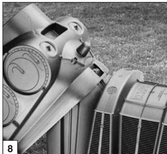
Attach end cap to chamber.

8. The last chamber in the trench requires a MultiPort end cap. Lift the end cap at a 45-degree angle and insert the connector hook through the opening on the top of the end cap. Applying firm pressure, lower the end cap to the ground to snap it into place. Do not remove tear-out seal.